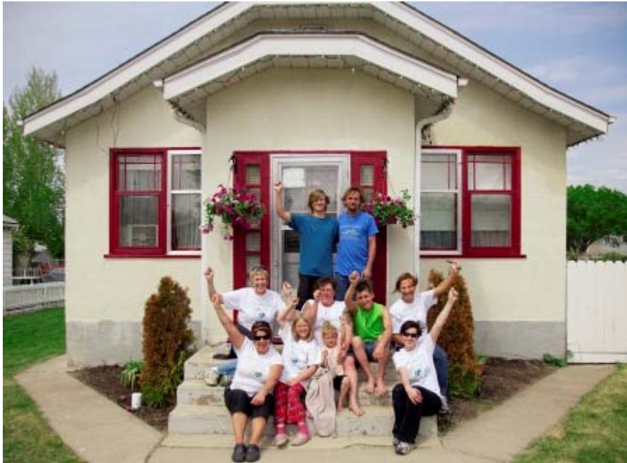
SaskEnergy volunteers with one of the Saskatoon families participating in the HELP initiative

The SaskEnergy Home Energy Legacy Program (HELP) kicked off its pilot year with five low-income homeowners in Saskatoon receiving home energy efficiency makeovers. The home improvements took place during the week of May 24 - 26.